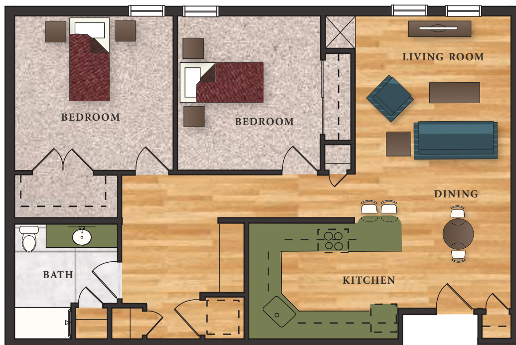
2 BEDROOM FLOOR PLAN 1,026 SQUARE FEET