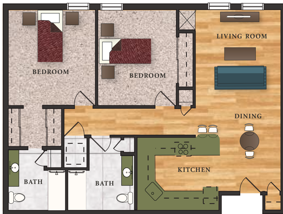
2 BEDROOM FLOOR PLAN 1,026 SQUARE FEET