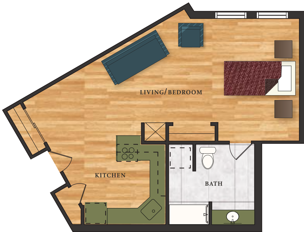
STUDIO FLOOR PLAN 698 SQUARE FEET