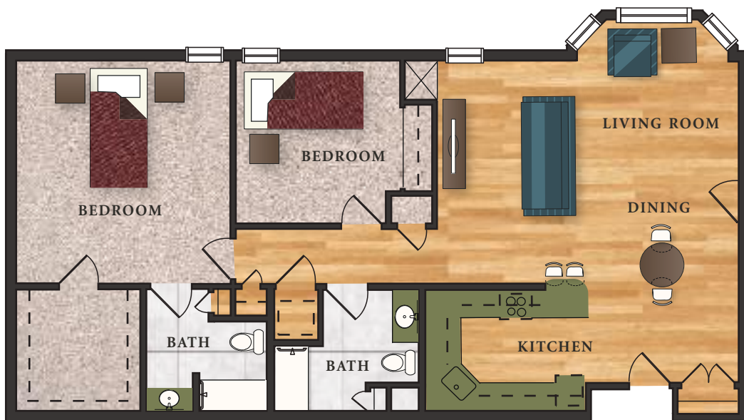
2 BEDROOM FLOOR PLAN 1,393 SQUARE FEET