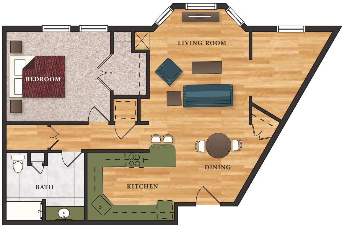
1 BEDROOM FLOOR PLAN 974 SQUARE FEET