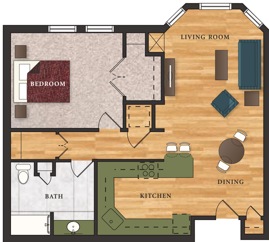
1 BEDROOM FLOOR PLAN 847 SQUARE FEET