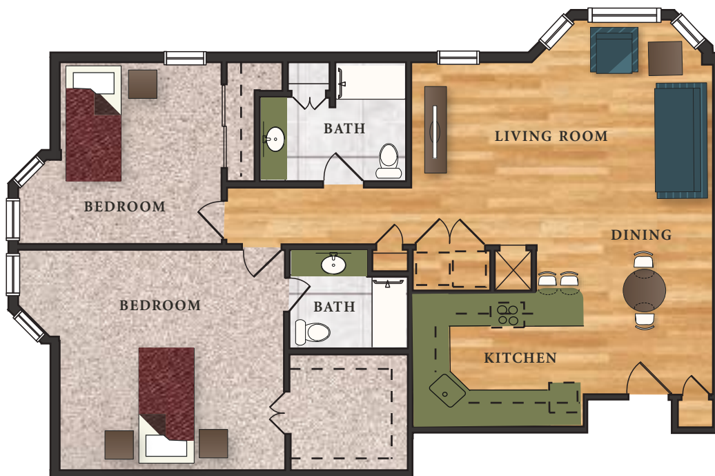
2 BEDROOM FLOOR PLAN 1,320 SQUARE FEET